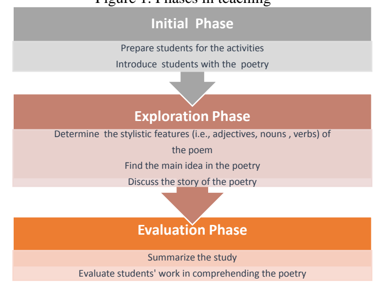
Figure 1. Phases in teaching

The research indicates that there were three phases in teaching activities. They were the initial phase, the exploration phase, and the evaluation phase. They were displayed in the following figure.